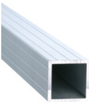
Aluminium profile 45 mm

Important accessory: anchoring plate; weight: 14 kg